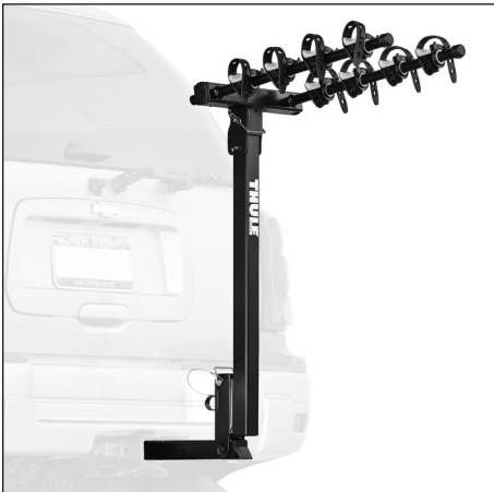
HITCHING POST PRO (934, 934xt, 935, 935xt, 936, 936xt, 937, 937xt, 951, 951xt)