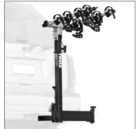
TRAILBLAZER (998, 998xt)