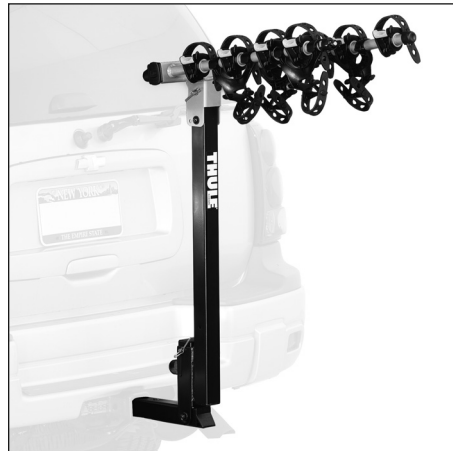
EXPRESSWAY (995, 995xt, 996, 996xt)